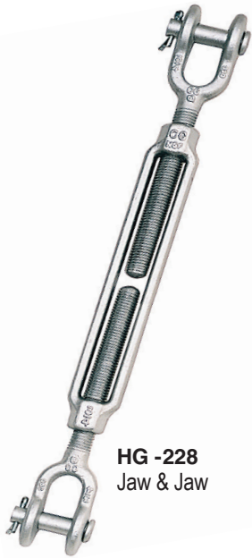
HG-228 Jaw & Jaw

Meets the performance requirements of Federal Specifications FF-T-791b, Type 1 Form 1 - CLASS 7, and ASTM F-1145, except for those provisions required of the contractor. For additional information, see page 476.