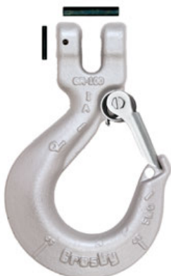
L-1339 Clevis Sling Hook