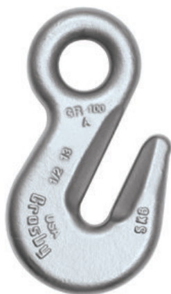
A-1328 Eye Grab Hook

* Ultimate Load is 4 times the Working Load Limit. ** 7/8 in. (22-23 mm) size does not have cam, latch attaches to unique pin.